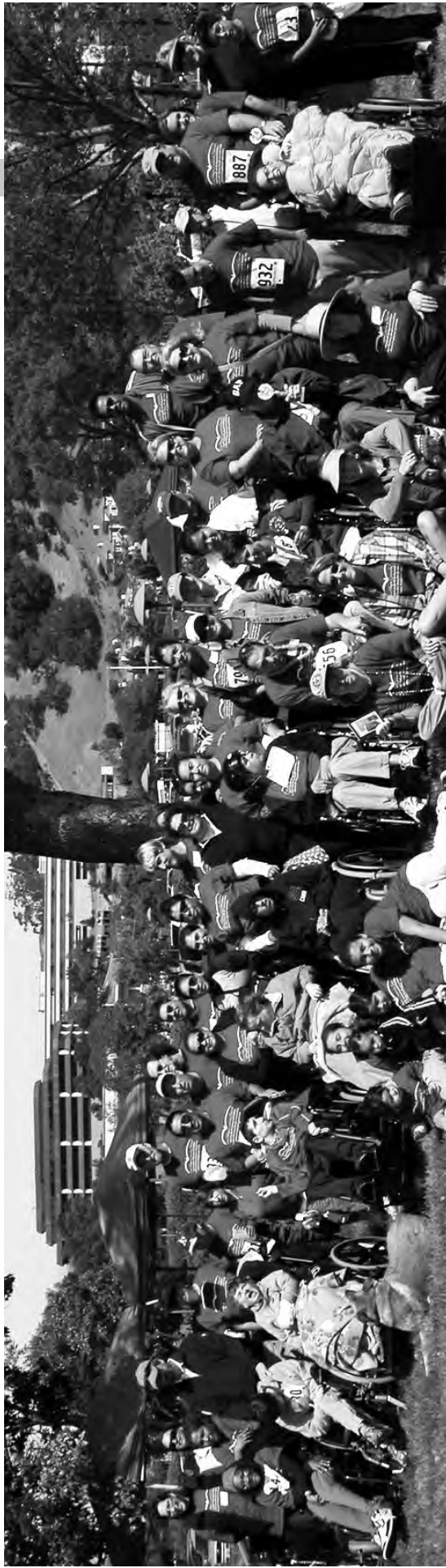
Clients with their circles of support – staff, family, friends, & volunteers, Marin Human Race 2011

Save the Date! Sat. 10/1/11 Casa Allegra Benefit Bocce Tournament To request Invitation or for Court Sponsorship see Insert