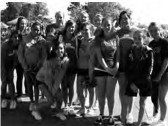
Redwood High JV Cheerleaders