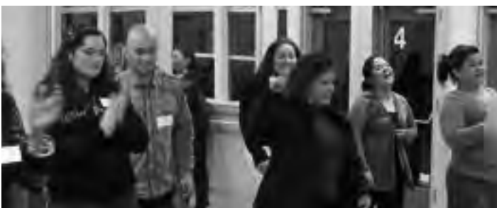
Waka Waka with CACS!